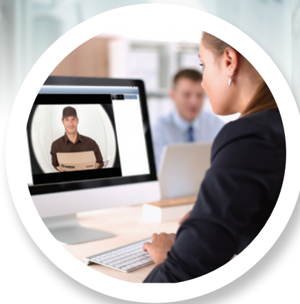
Receives live View and two way audio