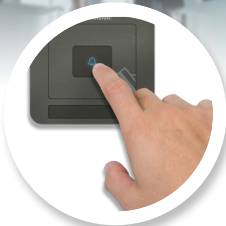
Touch and call